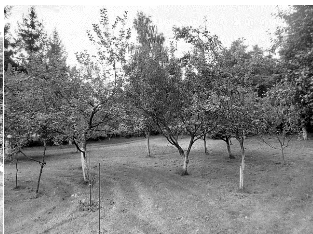
Fig. 1. Monitored apple orchard in the Vyšná Šebastová village, Eastern Slovakia

White sticky traps were of the oblong shape and dimensions 240×180 mm, with the active adhesive substance, polyisobutylene , – colorless, odorless, and tasteless viscoelastic chemical applied to the both of trap sides. According to the manufacturer, traps are targeted to capture following pests: